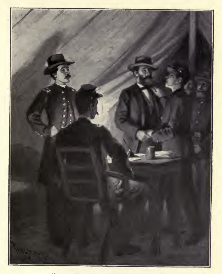
"FATHER, WHAT DOES IT MEAN?"